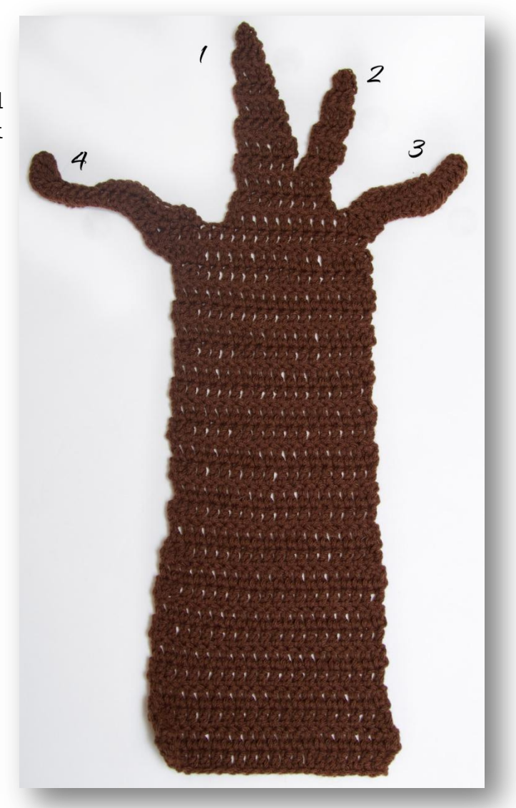
Seedling to Sapling Growth Chart (home) by Crystalized Designs