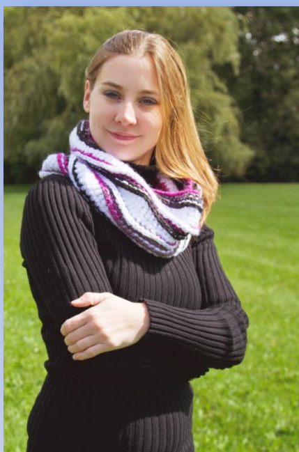
Loops & Threads Charisma in White and Black Raspberry

Bulky and warm, this cowl is perfect for the colder season but also adds style to any outfit! Two sizes make this cowl admirable by all cowl lovers. The large version can be worn long or wrapped once for a closer fit!