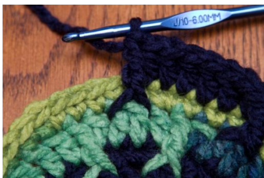
Stitch slightly hidden behind fp (slightly seen to the left in picture) may or may not be worked depending on directions