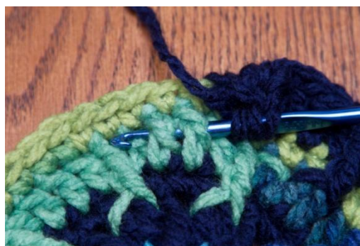
Fptr around one or two dc's 2 rounds below according to directions