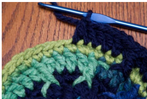
Dc according to directions

Photos below are for reference only. Specific rounds may differ than pictures below.