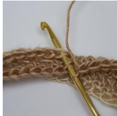
Row 4: 'dc in BLO of front of pocket and both loops of back of pocket'