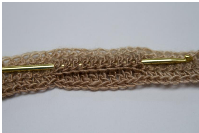
Row 4 closes the pocket and leaves the front loop open to work next row