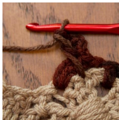
PIC B: Working in 1 st skipped st, 3 dc (Picture shows only 1 dc)