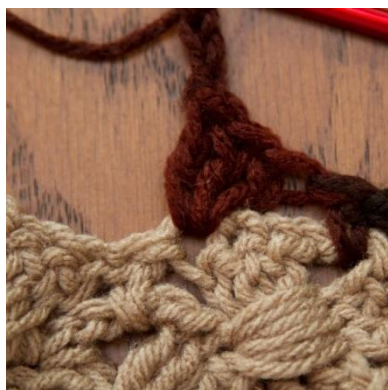
PIC A: Increase rounds: sk 2 dc, 3 dc in next, ch 3