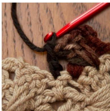
PIC C: Dc in next dc (The next woven shell st will have you dc in ch 3 space)