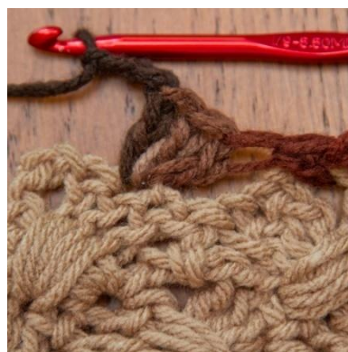
PIC D: Body of hat: sk 5 dc, 3 dc in next st, ch 3 (You will work 3 dc into 2 nd skipped st next)